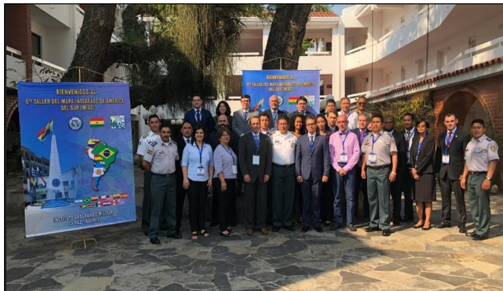
Fig. 11. Members of the USNS Cartography Commission at the Instituto Geográfico Militar, La Paz, Bolivia.

equivalent scale. These three agencies plan to set up web services to share the data, complete data revisions and updates through the third quarter of 2023, re-load the data into the new data schema, and deliver the final dataset to PAIGH by the end of 2023.