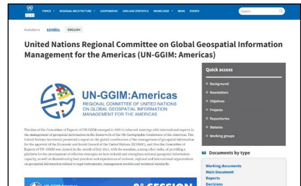
Fig. 14. UN-GGIM: Americas website.

The USNS thanks UN-ECLAC for their support in the creation and maintenance of these platforms.