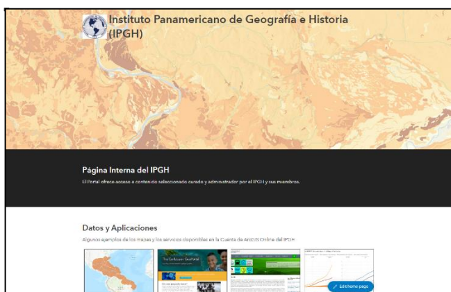
Fig. 15. PAIGH ArcGIS Online Regional Account website.