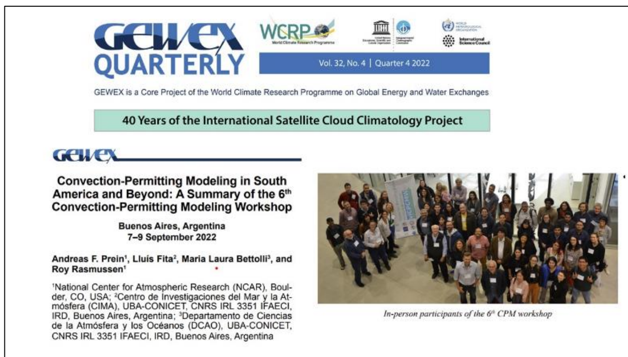
Fig. 22. GEWEX Quarterly newsletter, October 2022.