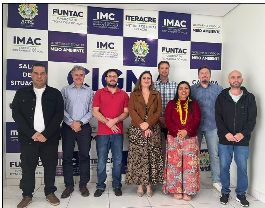
Fig. 18. Working meeting with CIGMA-SEMAPI, Rio Branco, Acre, Brazil