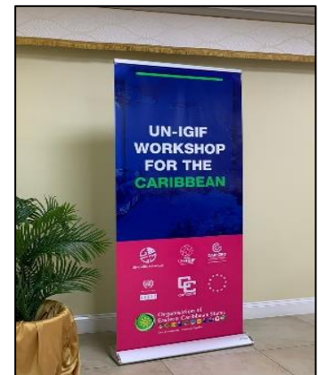
Fig. 8. UN-IGIF Workshop