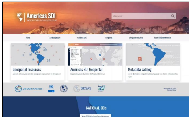
Fig. 13. Americas SDI website.