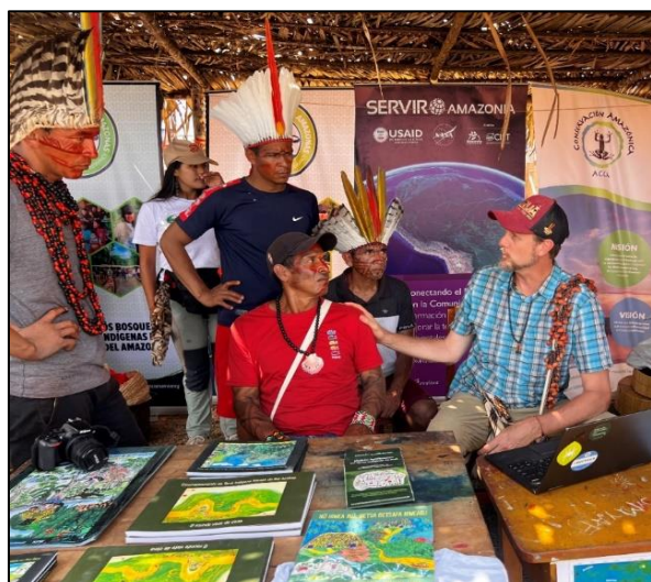
Fig. 20. (above) Working with the leaders of Apolima Arara, Acre, Brazil at the SERVIR Amazonia-ACCA-UAC-Richmond booth at the First Festival Intercultural de Yurúa and Juruá in Breu, Yurúa, Atalaya, Ucayali, Peru