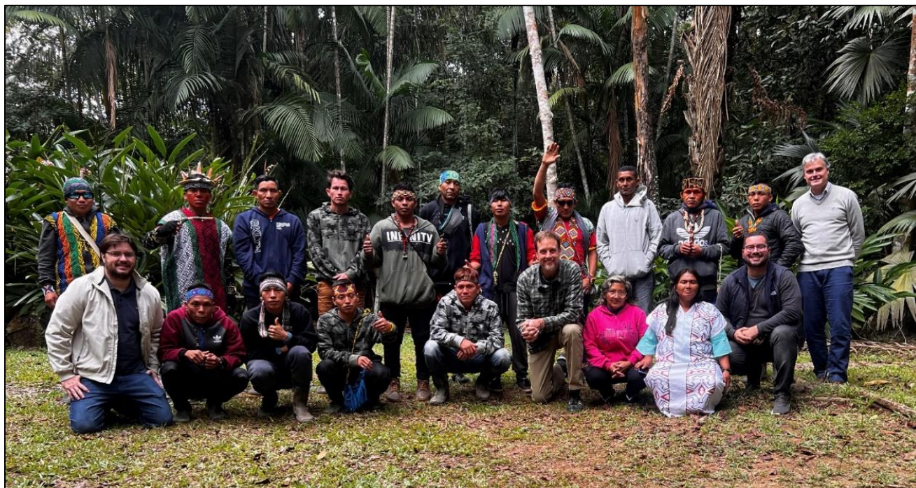
Fig. 17. Workshop meeting for the Indigenous Agroforestry Agents of CPI-Acre, Rio Branco, Acre, Brazil