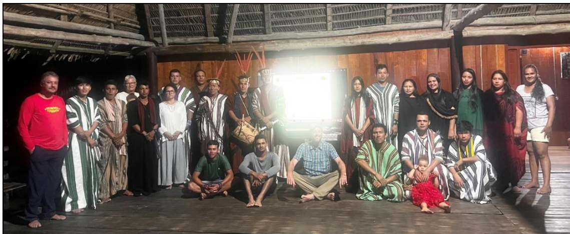
Fig. 16. Presentation of maps at the anniversary of Apiwtxa, Juruá River, Acre, Brazil