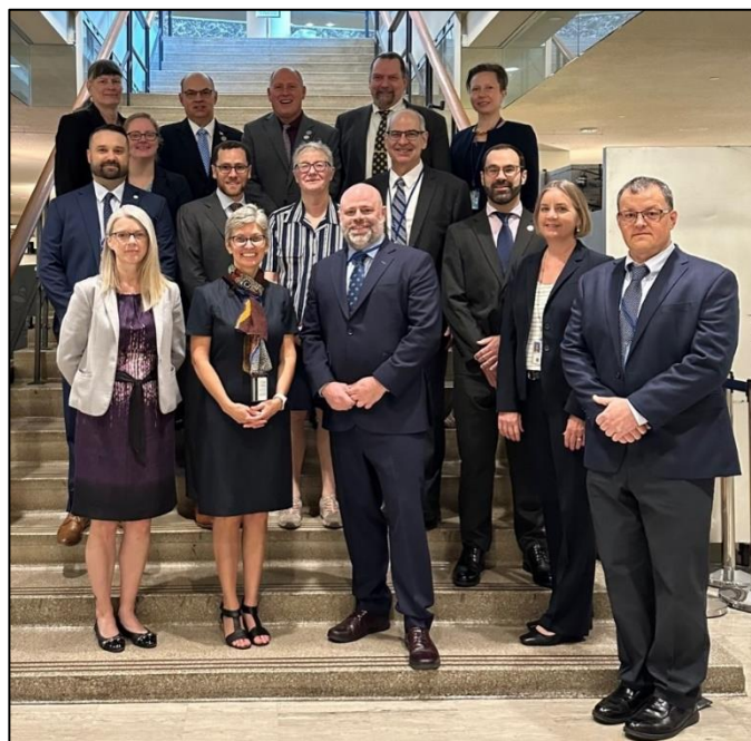
Fig. 6. The U.S. Delegation to the 13 th Session of the UN-GGIM, United Nations Headquarters, New York, USA.