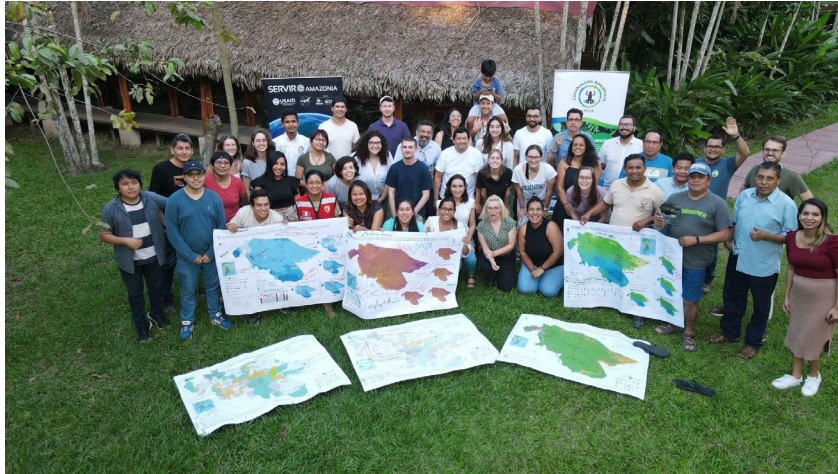
Participants of the “Workshop on Southwestern Amazon Transboundary Corridors and Ecosystem Services (NASA SERVIR Amazonía and GTASO)” Pucallpa, Ucayali, Peru.