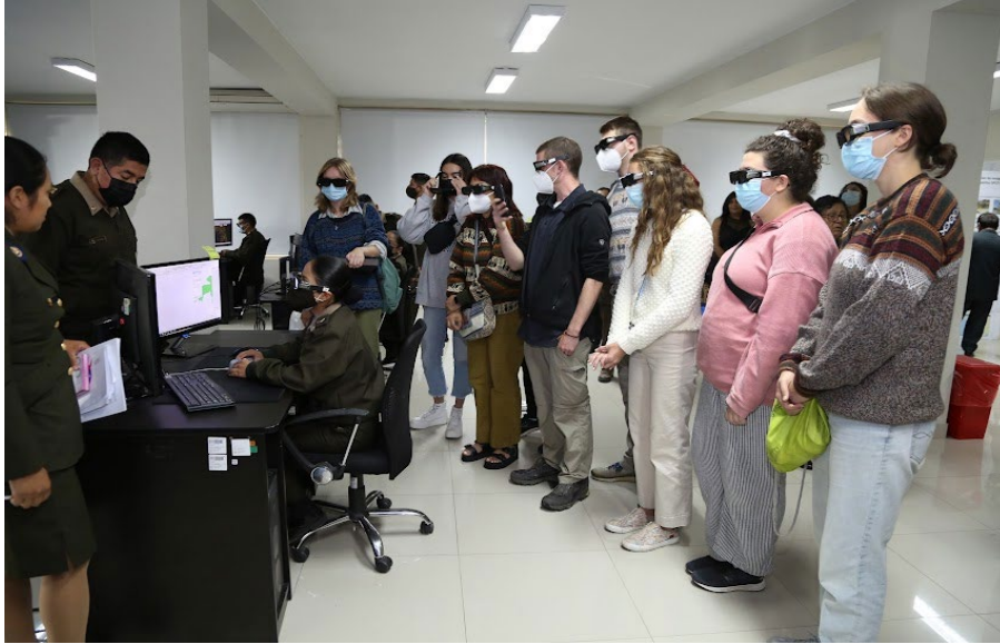
Above: University of Richmond students learn about photogrammetry at the IGN.